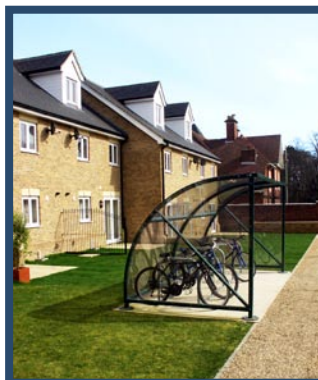
▲ Cycle Shelter