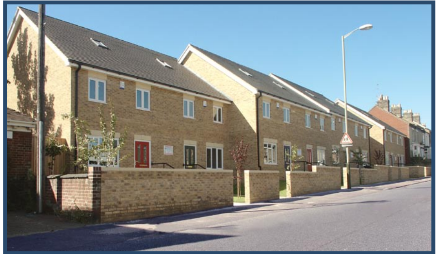
▲ Harvard Court

Each house at Harvard Court is available from 1st August – 1st August on a 12-month Assured Shorthold Tenancy Agreement. The rent of each house in Harvard Court is £1754 per calendar month, payable in advance. This equates to just under £81 per person per week . A Security Deposit of £1200 and guarantees will be required. Due to high demand all properties are let on a first-come first-served basis.