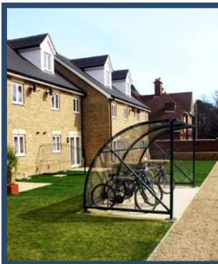
▲ Cycle Shelter

The Earl of Leicester bus stops adjacent to Harvard Court ▶